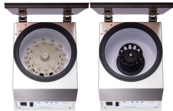
● Seromatic rotor for washing erythrocytes ● RS-110 rotor for washing lymphocytes