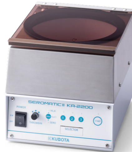
Immunohematology Centrifuge KA-2200